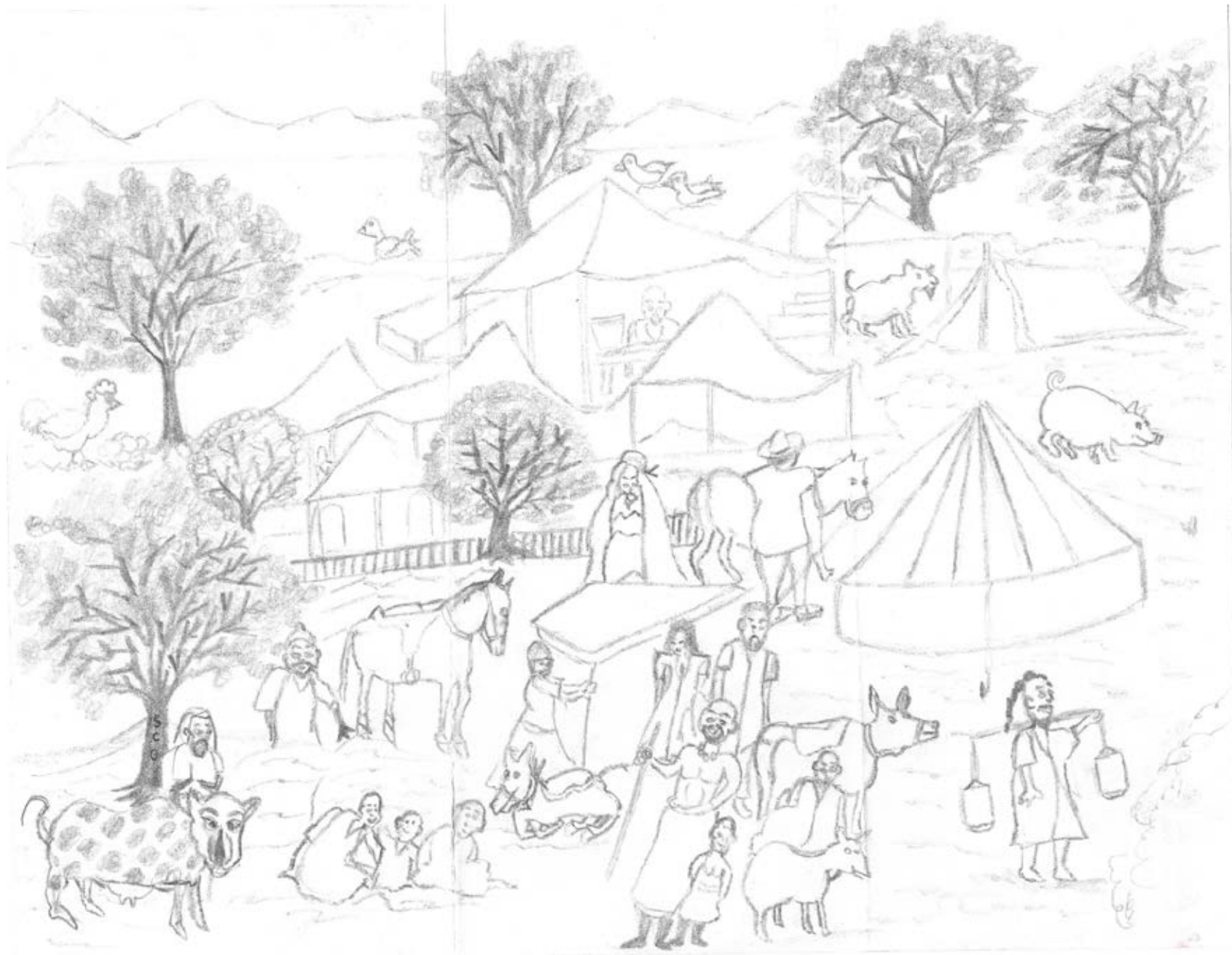
1800s Reservation of Africa Migration in Songhay Empire By S.C.G. Bellefonte, PA