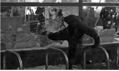
Burn Baby Burn! Continued...

to burn last night. No one is allowed to live freely in this new fascist dystopia of Priti Patel (wannabe Thatcher!) and Boris Johnson (who plays the clown but is as right wing as they come!), not only does the bill give the power to 'disturbed citizens' and the cops to literally move on travelers even of one vehicle at the slightest complaint from the obedient public, but also gives them the ability to take peoples vehicles and possessions. Apart from an attack on van and caravan dwellers this is the racist attack from the Tory government on Roma, Gypsy and Irish Travelers, a group who have always been attacked in the 'country of apparent toleration'.