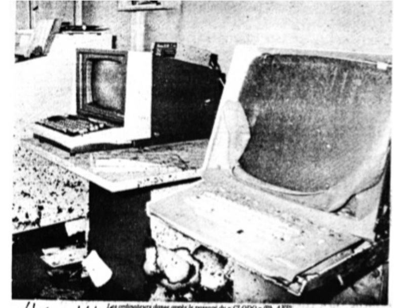
A //// Les ordinateurs danse après le passagé du « CLODO »